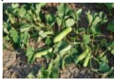
(Agricultural Research Station (Fruit Crops), JAU, Mahuva)

Vegetable growers of South Saurashtra Agro-climatic Zone growing bottle gourd cv. Pusa Naveen under sodic soil and brakish irrigation water condition are advised to apply FYM 5 t/ha along with half recommended dose of chemical fertilizer i.e. 50:25:25, N:P:K kg/ha and poultry manure 3.3 t/ha to get maximum yield and net return.