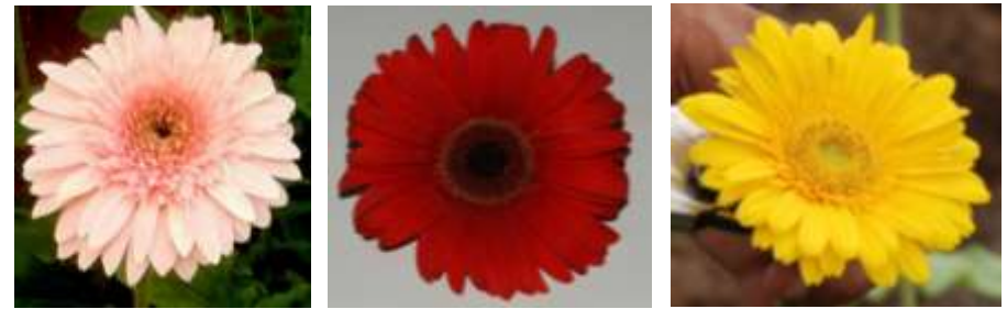
(Department of Horticulture, CoA, JAU, Junagadh)

The farmers of South Saurashtra Agro-climatic Zone, interested to cultivate gerbera flower crop under green house are advised to grow varieties Pink Elegance (pink), Savannah (red) and Dana Allen (yellow) for obtaining higher yield and income with good quality of cut flowers.