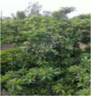
(Fruit Research Station, JAU, Mangrol)

Farmers of Saurashtra region interested to organic cultivation of sapota are advised to apply FYM @ 90 kg/tree (8 year) per year during June-July under saline irrigation water (EC 10-14 \text{ dSm}^{-1} ) for obtaining higher yield with net return and for improving soil fertility and microbial status of soil.