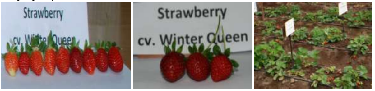
(Department of Horticulture, CoA, JAU, Junagadh)

Farmers of South Saurashtra Agro-climate Zone, interested in strawberry cultivation, are advised to grow cv. Winter Queen under protected structure (Fan-pad Cooling Poly House) for getting higher yield and net return.