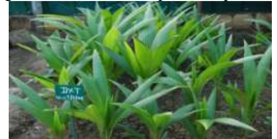
(Agricultural Research Station (Fruit Crop), JAU, Mahuva)

The nursery growers of South Saurashtra Agro-climatic Zone producing coconut seedlings are advised to grow coconut seed nut in the month of June under low cost net house (50 % shed net) to get higher quality seedling and net return as compared to open field.