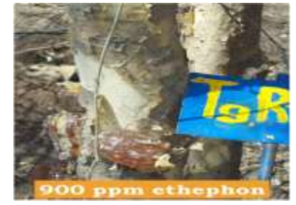
(Grassland Research Station, JAU, Dhari)

The farmers of North Saurashtra Agro-climatic Zone are recommended to apply 5 ml of 900 ppm ethephon [2.25 ml Ethrel (40%) in 1 liter of water] by drilling 5 cm hole of 1 cm diameter on stem at 1 m height above the ground of about five year age of Acacia senegal (Gorad) during first week of March for getting higher gum production and maximum net return.